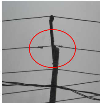
A portion of the network with several weak jointed parts.