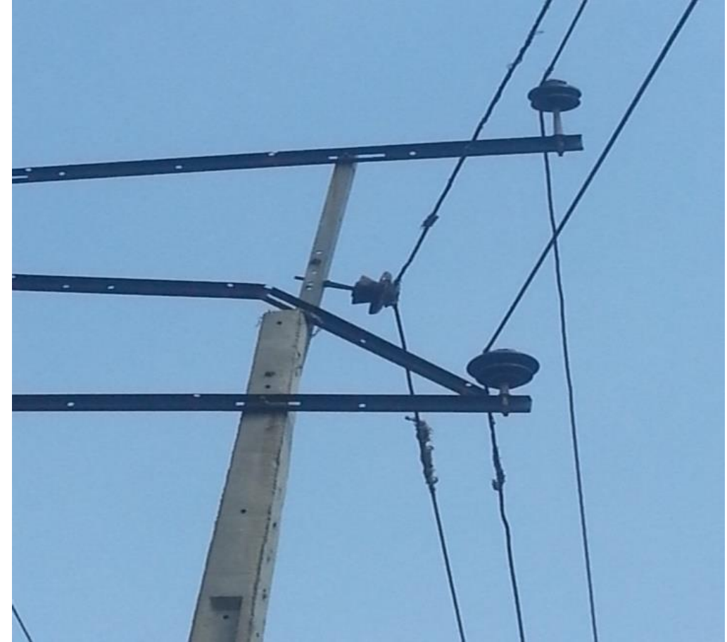
Bent and ungalvanized angle iron, multiple joints on conductors along CBD IBB Highway, Wuse, Abuja, FCT