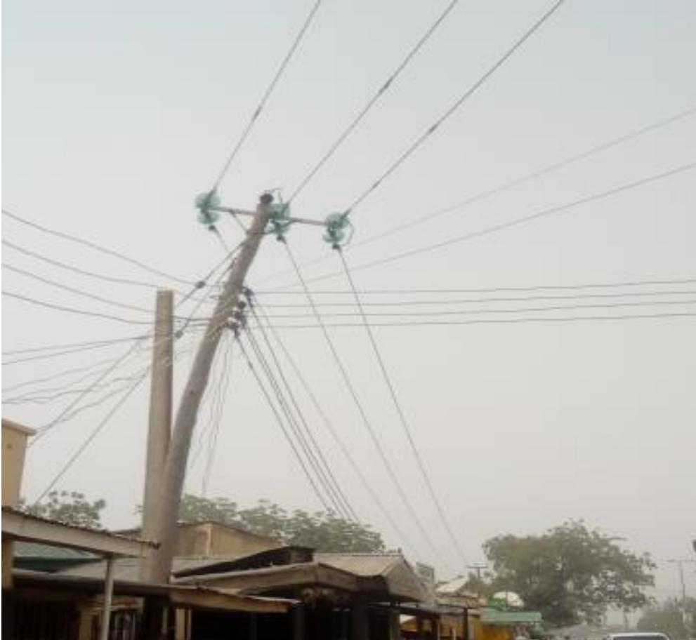
Bent pole and conductors running over building opposite ECWA Church, Misau, Bauchi State