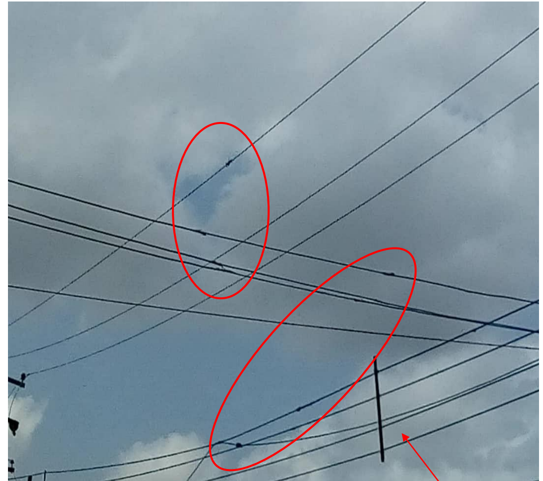
Pieces of concrete removed but network remains unsafe with several joints over the major road at Opebi Road by Osho Street (Link Rd) Junction, Ikeja