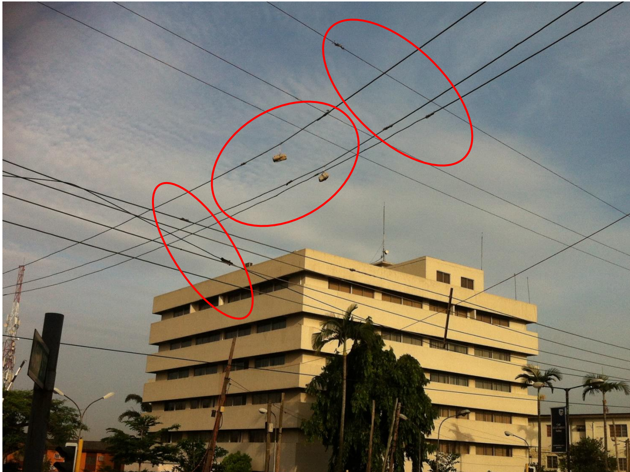
Pieces of concrete used to support conductors and multiple joints on HT lines at Opebi Road by Osho Street (Link Rd) Junction, Ikeja.