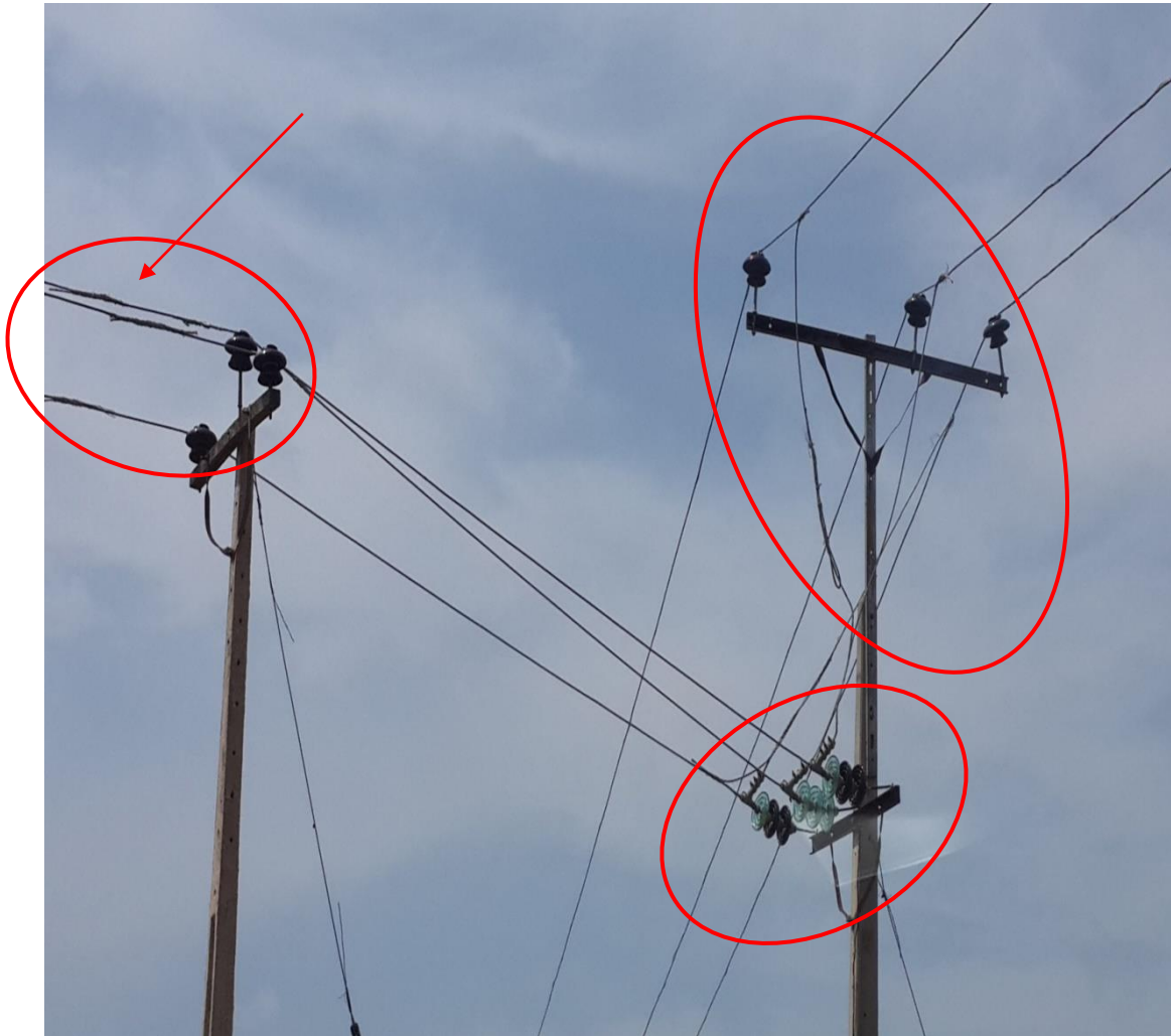
Poor and unsafe constructions, joints over highway, terminations and dangerous Tees-off at Kuje, Abuja FCT