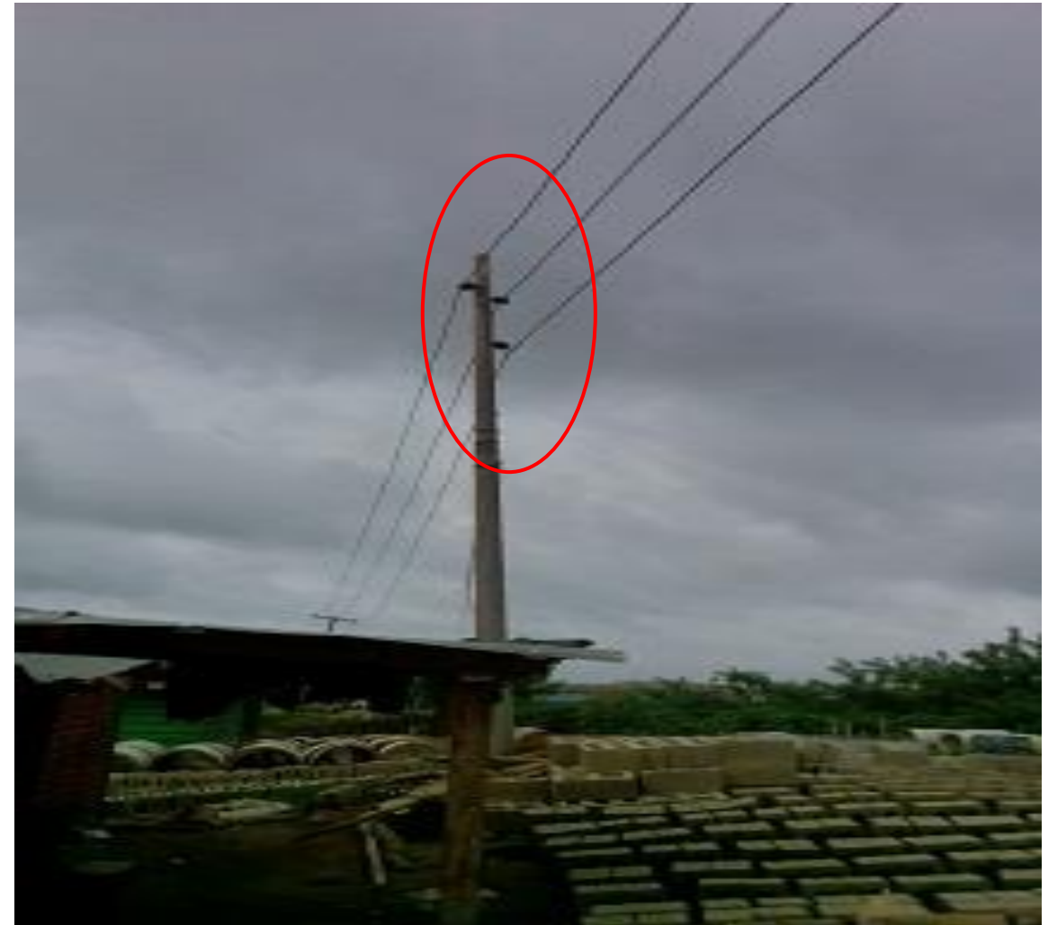
No cross arm, inadequate clearances, conductors directly fixed on insulators on the pole at Oba-Ile, Akure.