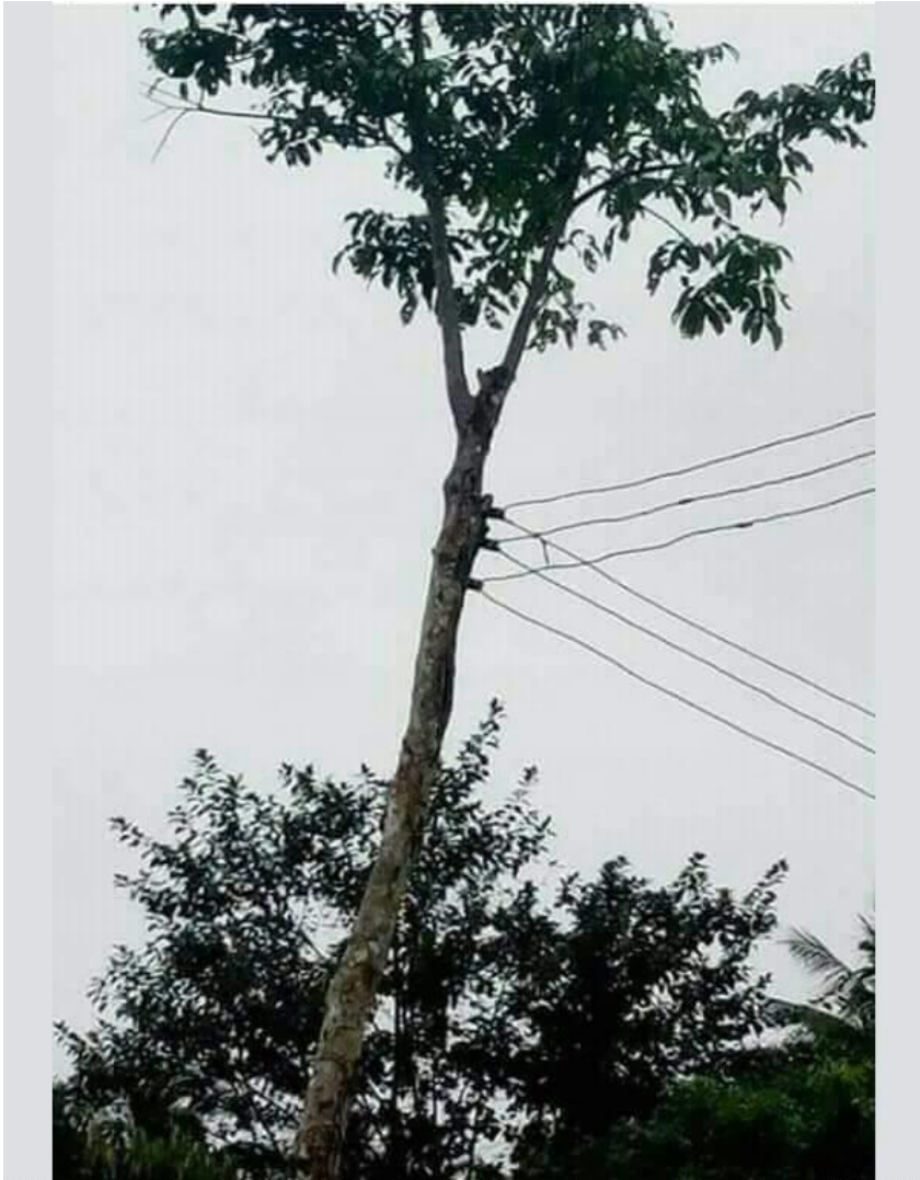
Who owns this network?