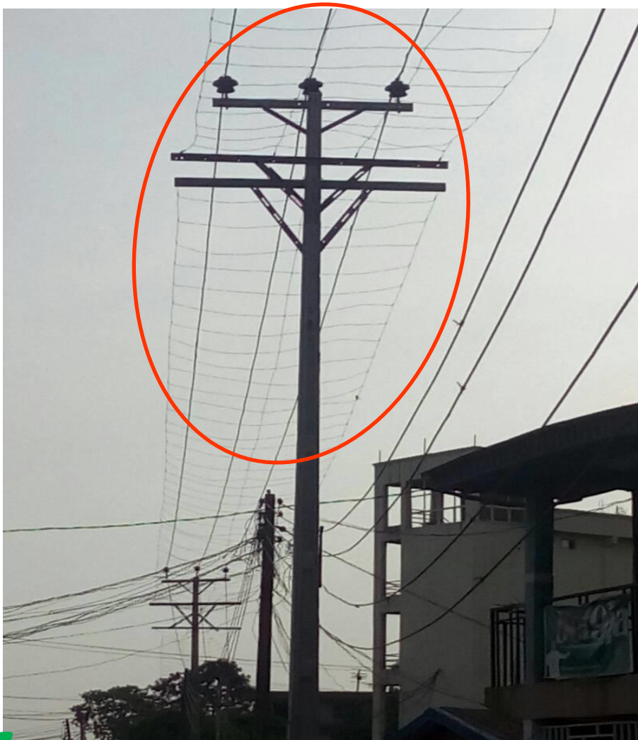
✓ Metallic Cradle Guard installed at a street in Benin City needs adequate earthing.