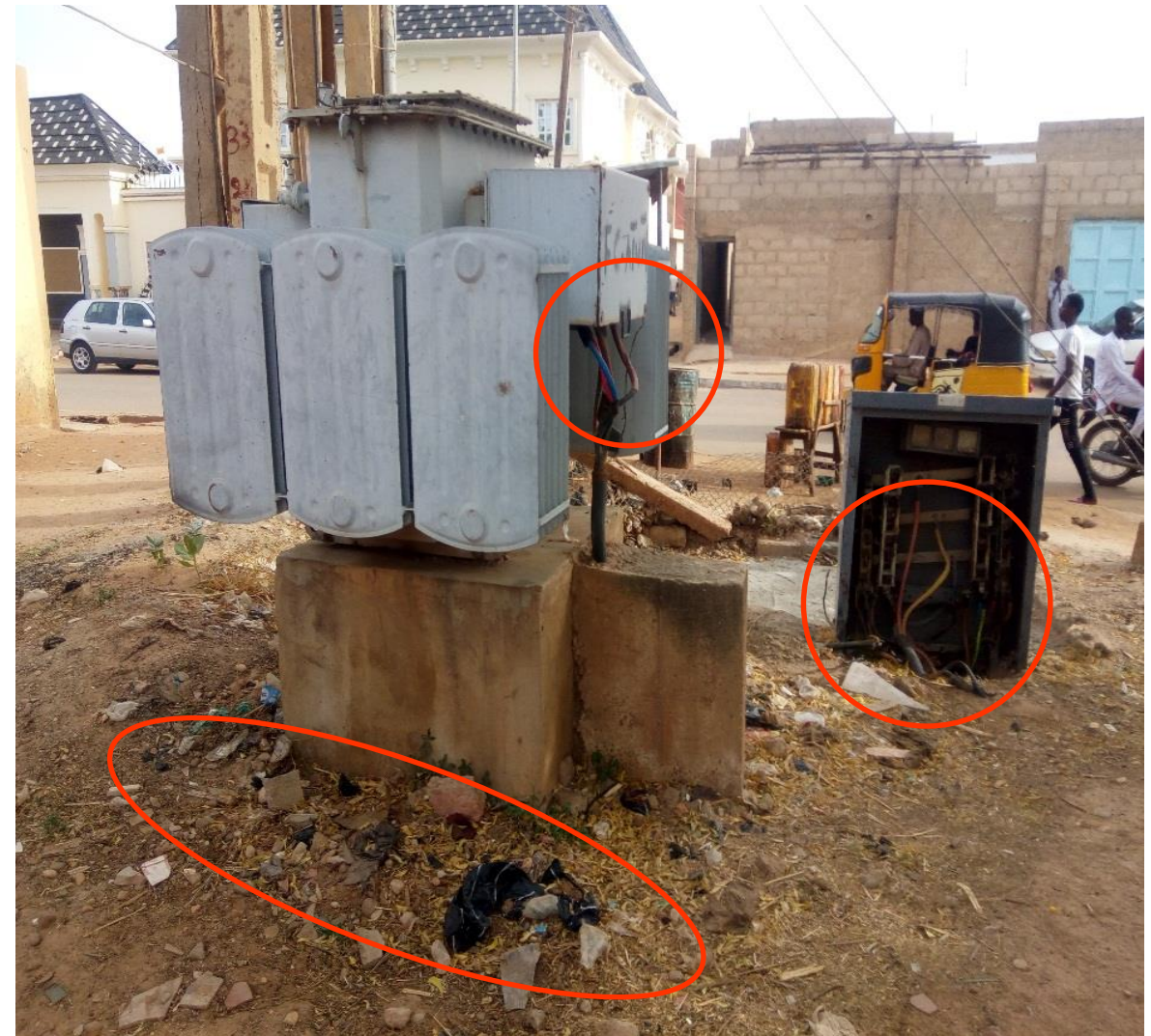
✗ Unprotected substation at Kwanan Bukari, opposite Gwauron Gida, Katsina.