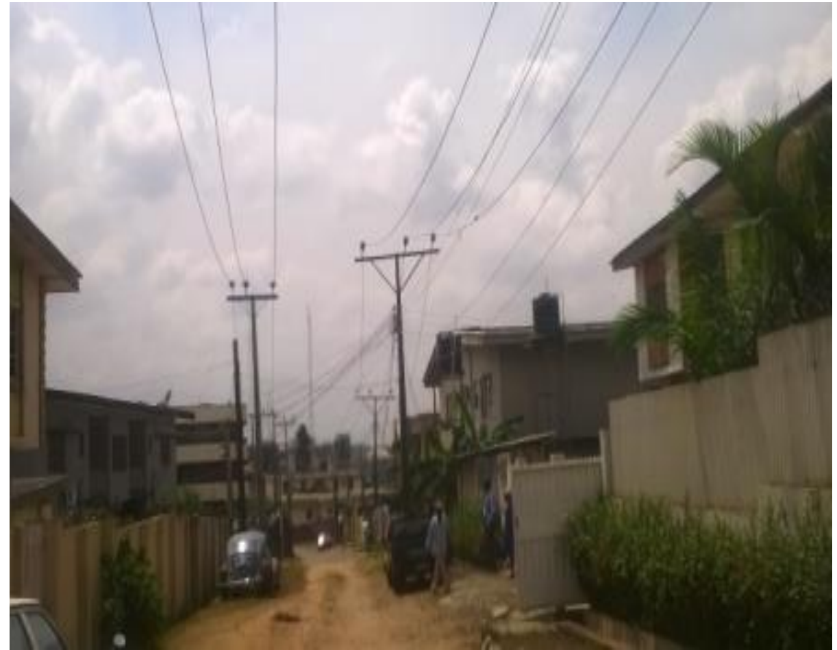
HT poles were seen planted inside the premises of many houses. This constitutes serious risk to occupants of the affected houses. Right of Way (ROW) should be observed and poles should be relocated away from the buildings. [IBADAN]