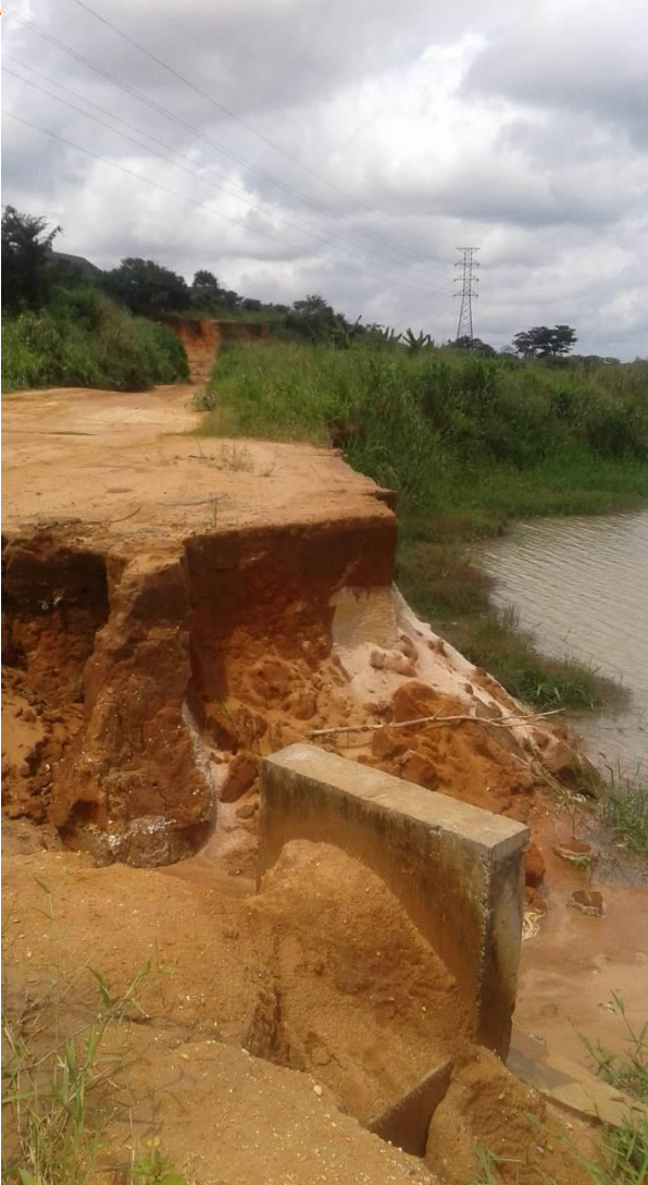
River Bank erosion and reported sand dredging activities in Otamiri, Imo State, and Amechi village, Enugu State, endangering transmission line towers.