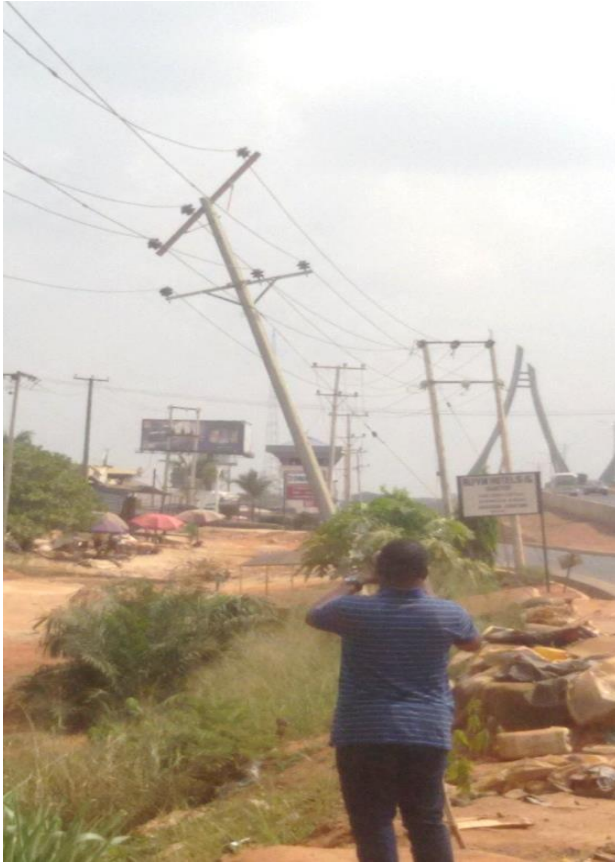
Substandard, Unsafe and Dangerous construction at Awka, Anambra State Accident waiting to happen soon.