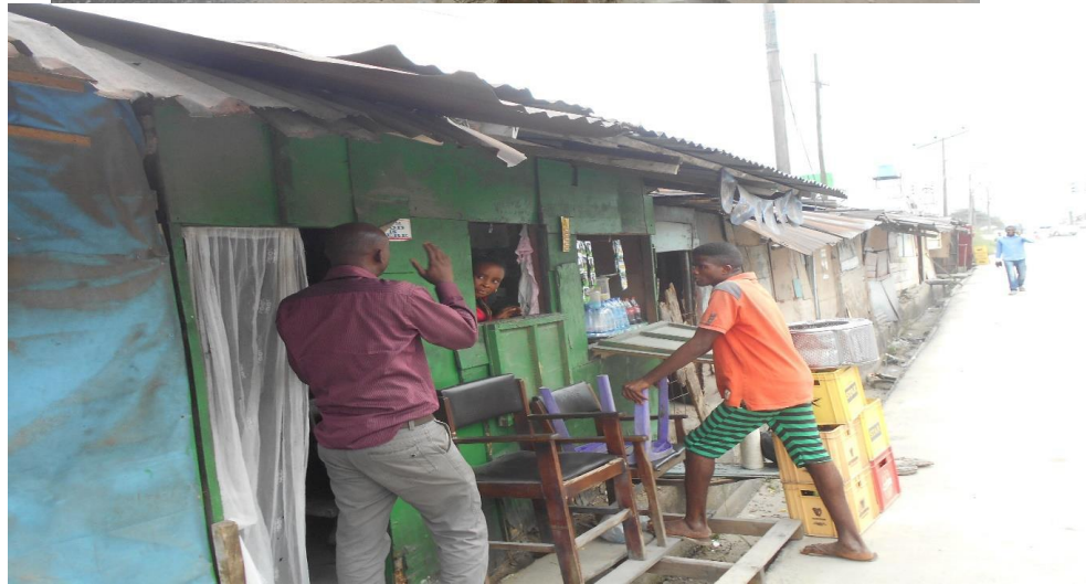
Re-enforcing Public Safety Campaigns by PHEDC