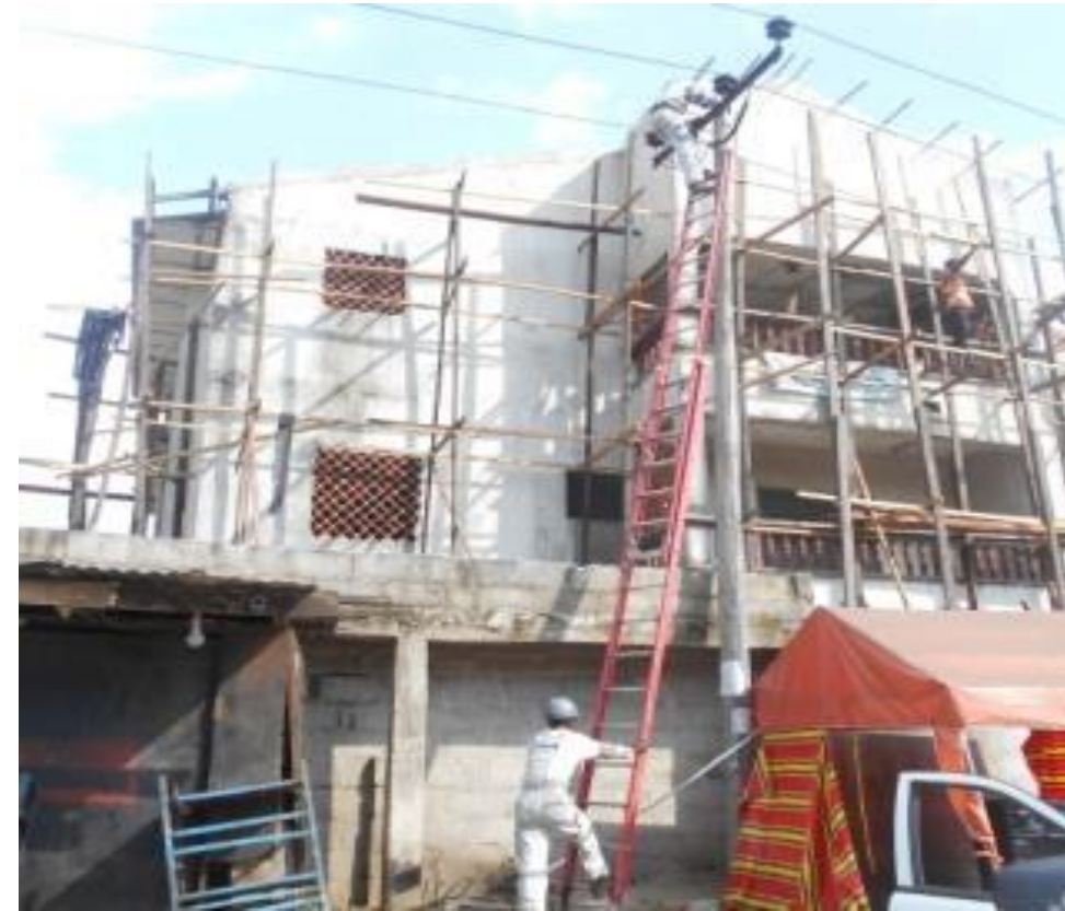
Building of structure under HT line at Iwofe, Rivers State. Scaffolding /Work demolished with assistance from the security agencies. The building construction engineer was arrested